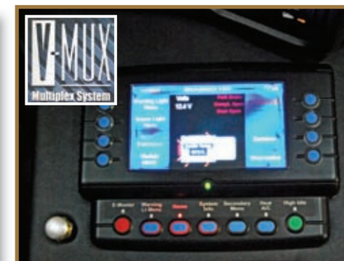
Programmable push-button technology