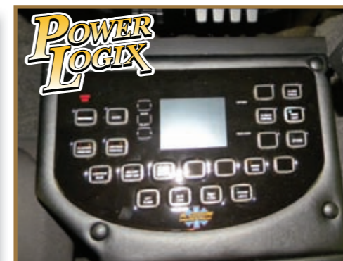
Multiplexed technology and reliability