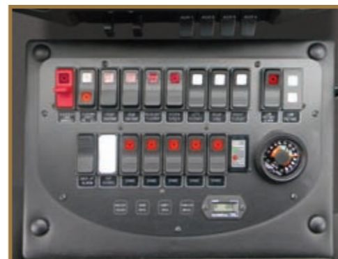
Conventional electrical system