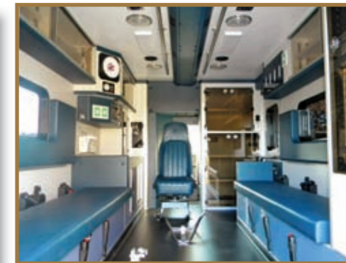
Dual squad benches