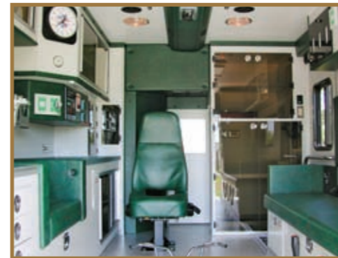
Traditional EMS layout